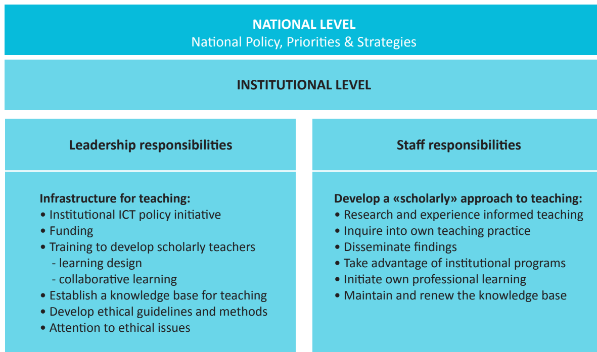
Figure 3. Responsibilities at national and institutional levels.